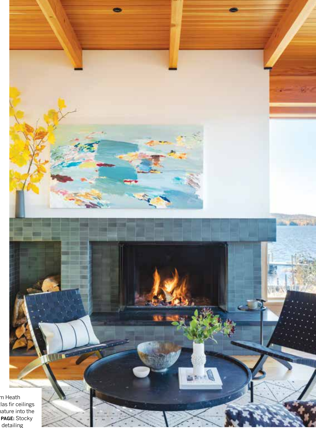
Handmade tiles from Heath Ceramics and Douglas fir ceilings bring the colors of nature into the living room. FACING PAGE: Stocky fir beams with steel detailing frame the custom door at the main entrance. At a glance, the home's simplicity belies the high craftsmanship behind it. "There was a lot of behind-the-scenes work to make everything line up," says builder Tony Bourque.

pend time on a lake, and you'll notice the water has two colors. One is a resplendent blue that floats under the slanted light of the rising or setting sun. The other is a blinding white that ignites the surface at the height of the day.